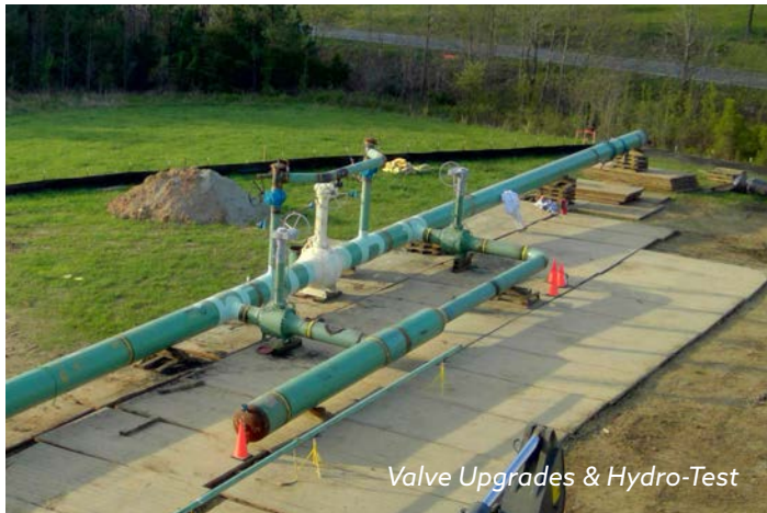
Valve Upgrades & Hydro-Test