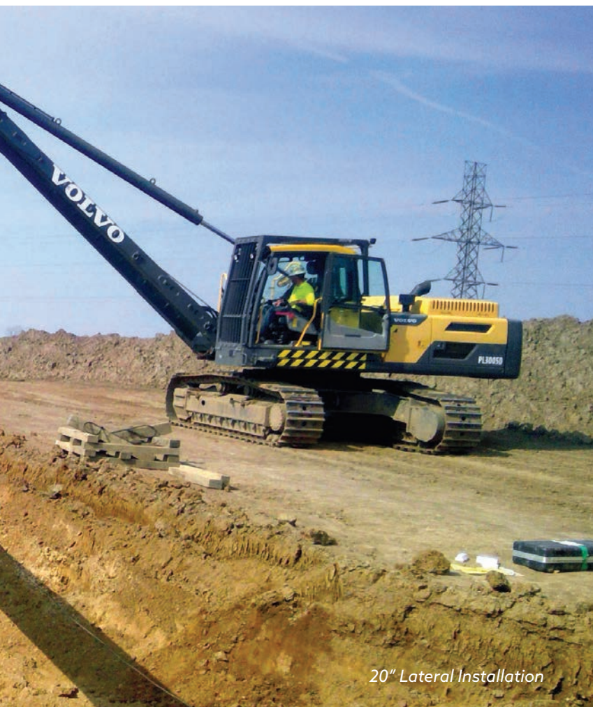
20" Lateral Installation