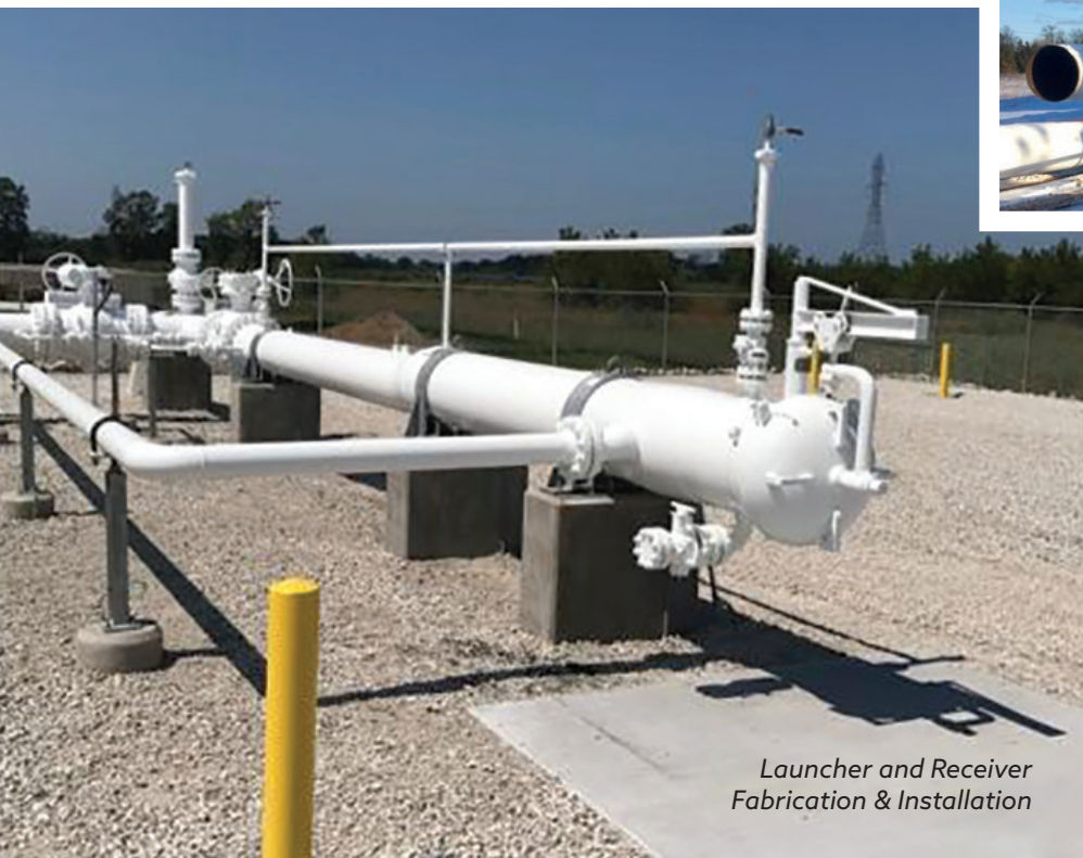
Launcher and Receiver Fabrication & Installation