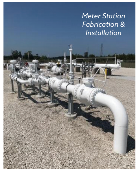
Meter Station Fabrication & Installation